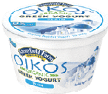
Stonyfield Farms Blueberry Greek Yogurt