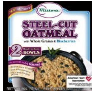
Milton's Steel-Cut Oatmeal with Blueberries