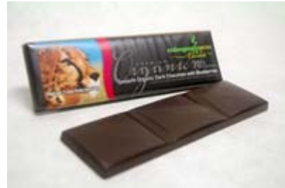
Endangered Species Dark Chocolate with Blueberries