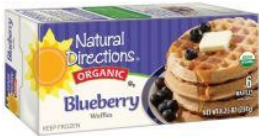
Natural Directions Organic Blueberry Waffles