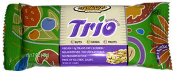
Mrs. May's Naturals Trio Blueberry Cereal Bar