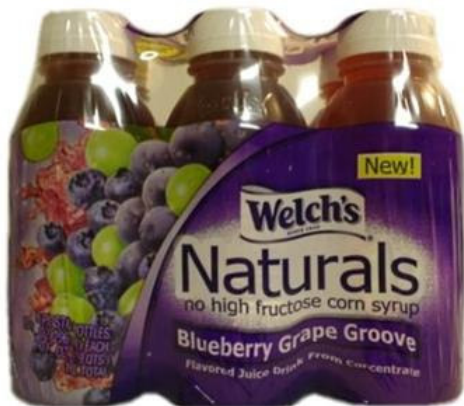
Welch's Blueberry Grape Groove 100% Juice