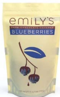
Best New Confection Emily's Dark Chocolate Covered Blueberries