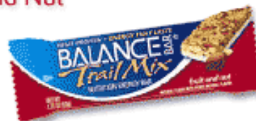
Best New Snack Balance Trail Mix Fruit and Nut Bar