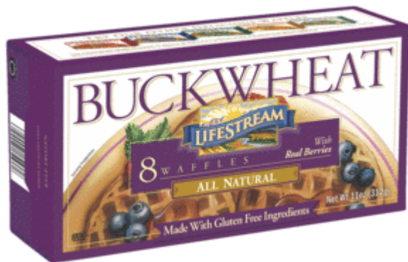
Best New Bakery Product Lifestream Foods Blueberry Buckwheat Waffles