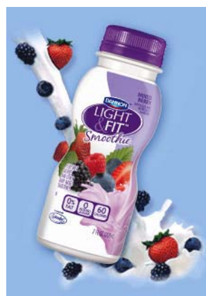
Best New Dairy Product Dannon Light & Fit Mixed Berry Smoothie